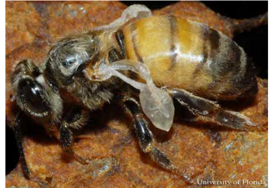
Figure 3. This poor worker has deformed wings caused by a virus transmitted by varroa mites. This colony is infested with mites, but you may not be able to see any. Make sure you learn how to monitor for them.

Currently, the worst pest for honey bees is the varroa mite ( Varroa destructor ). This mite damages growing bees, and it transmits viruses in the colony. The mite population generally peaks in the fall, right when the colony is preparing for winter, and damage at this time is particularly devastating. It is a common myth that first year colonies do not have to worry about the varroa mite. The continuation of this myth results in a LOT of dead colonies for beginner beekeepers. If you live in the United States, then chances are you will have a problem with varroa mites. Go into your season prepared to manage this pest, as it is a huge reason for colony death among hobbyist beekeepers. There are many options for managing varroa, and make sure you take time to educate yourself on how you can prevent them from taking over your bees.