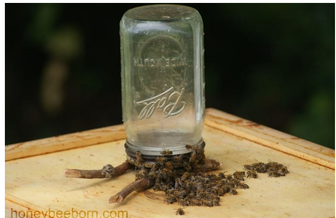
Figure 1. This is a good example of a cheap feeder. The sticks allow the bees to drink syrup out of the holes in the lid of the jar. This beekeeper did not add a new jar quickly enough, and it went dry. If your bees need feeding, don't let them run out of food! The amount they need will depend on weather, strength of the colony, and other resources, and it may be more than you expect.

Most new beekeepers underestimate the amount of food that a new colony needs. Remember that you have a small animal under your care (3-5lbs when it starts, and growing to 15lbs!). Your job as a beekeeper is to make sure that they have the nutrition they need to stay healthy and grow. Nutritionally stressed bees are more likely to get sick and die. All colonies need food to survive, but your new colony also needs food for growth . Just like growing kids need more food, so do growing colonies. The bees will be expending a lot of energy on wax production if they aren't on drawn comb, and they will be putting a lot of energy into raising more larvae.