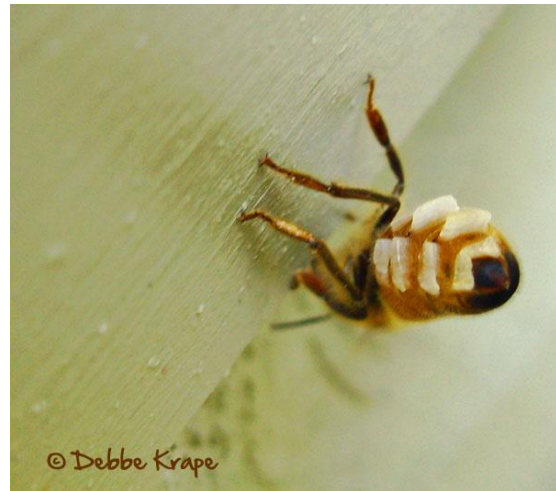
Figure 2. Wax flakes emerging from the abdomen from a young worker. These excretions take a lot of energy to create, and require bees of the right age.

Your bees need to fill the area they will be wintering in (usually 2 deeps or 3-4 mediums) with comb as soon as possible. This is called the brood area, and the space that the bees need to live. Once this is filled with drawn comb, your bees have enough space and can focus on making honey for winter (and for you!).